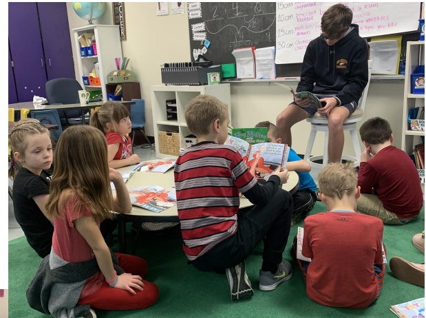
Above: The BWHS boys basketball team came and read a book to the 2nd grade students! At left: 3rd grade students work in art class.